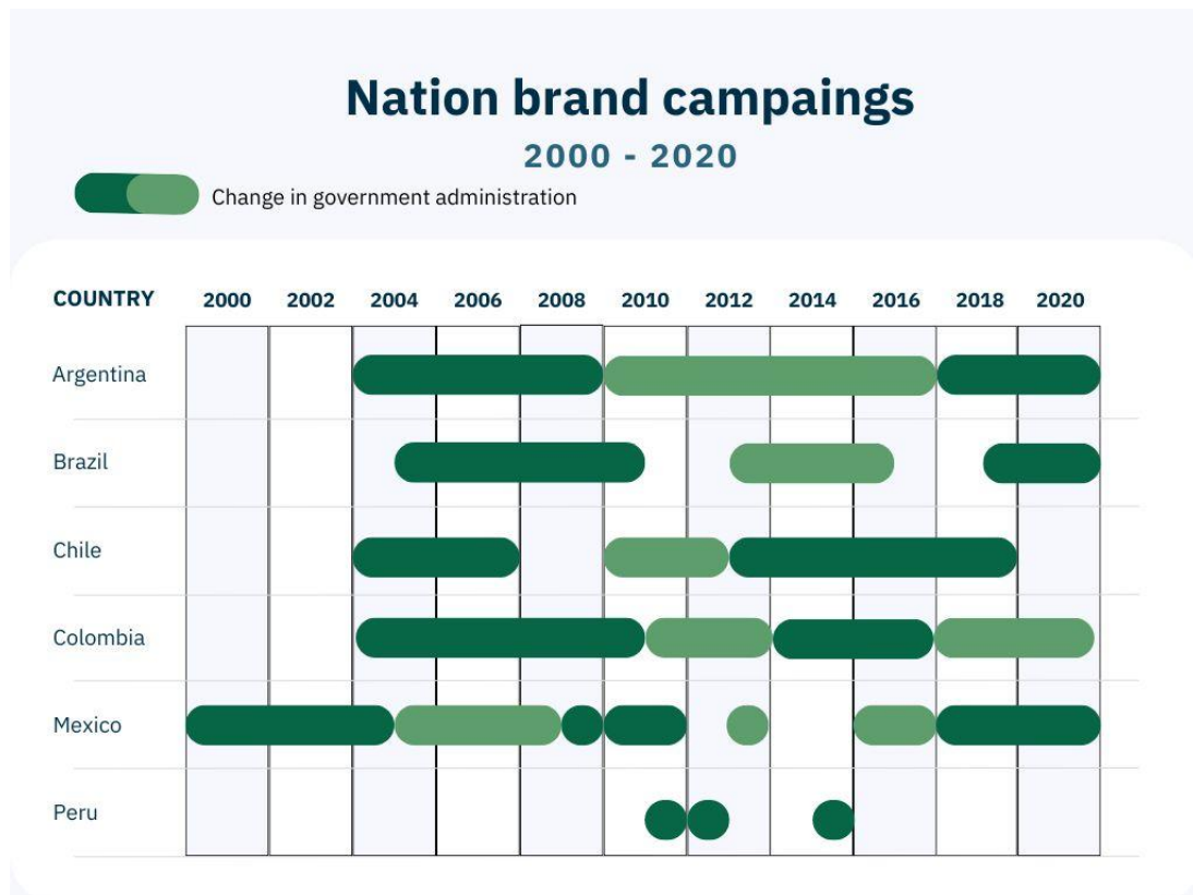
Figure 11. Table of Nation-branding Campaigns and Changes in Government

Despite these discourses, the stability of the examined cases generally depended on the interests of incumbent governments. Figure 11 allows for identifying nation branding strategies across different presidential periods. Changes in the color of the bars indicate strategy modifications accompanied by changes in government.