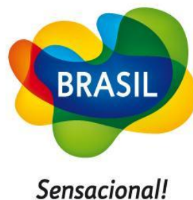
Figure 2. Visual Identity of Brazil's Brand in 2004

In 2004, a contest was held to create the visual identity for Brazil's Brand, to serve as both a tourism logo and an identifier for exports ( Figure 2 ). This new logo was incorporated into promotional programs, dissemination efforts, and support to market Brazilian products, services, and tourist destinations in international markets (Ramos & Noya, 2006). The following year, a cooperation agreement was signed between EMBRATUR and APEX for the former to participate in APEX's international trade events and missions (Khauaja & Emzo, 2007). Additionally, the Brazilian Tourism Office was opened to position the country as a tourist destination (Echeverri-Cañas & Trujillo Gómez, 2014).