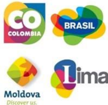
Figure 7. Comparison of Visual Identities of Colombia, Brazil, Moldova and Lima

perspective. A new campaign targeting these countries, titled “Colombia: Realismo mágico” (Colombia: Magical Realism) referred to the work of Gabriel García Márquez and also included video testimonials (Semana, 2015).