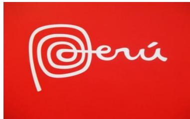
Figure 10. Logo of Peru's Brand

In 1996, the Commission for the Promotion of Peru for Export and Tourism (PromPerú) was established to plan the country's promotion strategy for investments, tourism, and exports. However, the Marca Perú strategy began in 2011, during the government of Ollanta Humala, with an initial campaign aimed at boosting domestic and international tourism (Jiménez Mendoz, 2016). This strategy was driven by PromPerú and implemented by FutureBrand, who received twelve million Peruvian soles (about 900,000 US dollars) and created a Peru logo with the Nazca lines representing the letter "P" ( Figure 10 ).