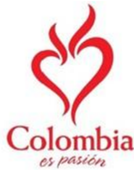
Figure 6. Logo and Slogan of Colombia's Brand in 2005

Nation brand strategy "Colombia es Pasión" was in place from 2005 to 2011, with an initial budget of $429,700, 30% of which came from Proexport and the rest from the private sector through the sale of brand licenses (Echeverri-Cañas, 2014). However, the total budget amounted to three million dollars (Ramos & Noya, 2006). The brand was launched in 2005 and presented to local media and events at five soccer stadiums, where "a minute of passion" was organized and the logo was unveiled, this time featuring people on the soccer field. The strategy also included a website in Spanish, English, and German, as well as a brick-and-mortar store as of 2007 (Florez Torres, 2011). Other initiatives included the "Colombia es Pasión" cycling team and a song called "Somos Pasión" (We are Passion) (Colombia2opictures, 2012; Colombia, n.d.), participation of local celebrities in promotional campaigns, and the involvement of private companies such as Nacional de Chocolates, Movistar Colombia, and Avianca, who paid royalties for using the brand (Florez Torres, 2011).