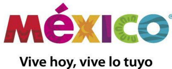
Figure 9. Logo of Mexico's Brand in 2010

After decreeing 2011 as the National Year of Tourism, the Mexican government hired Simon Anholt as a nation branding advisor for 18 months (Villanueva Rivas, 2013). Anholt's assessment was that Mexico had historically focused on its economic, labor, cultural, and academic relations with the United States, allegedly missing out on economic opportunities offered by globalization. Moreover, it had apparently lost control of its narrative, leaving it in the hands of U.S. media, which, as he stated, boiled the country down to a caricature of a tropical, violent, corrupt territory (Anholt, 2012, p. 124). The Mexican government responded with a new strategy focused on tourism and culture, sustainability, and economy and investment, targeting successive phases first in the United States and Canada, then Europe, and finally some Asian countries (Díaz & Pérez, 2012). Despite these changes, it is noteworthy that—unlike other Latin American countries—various governments retained the logo introduced in 2005 ( Figure 9 ).